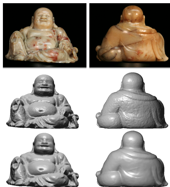
Figure 3: Reconstructing coloured marble. Top: Two input images. Middle: model obtained by multi-view stereo method from [HS04]. Bottom: proposed method. The resulting surface is filtered from noise while new high frequency geometry is revealed (note the reconstructed surface cracks).

construction via graph-cuts. In Proc. European Conf. on Computer Vision (2002), vol. 3, pp. 82–96.