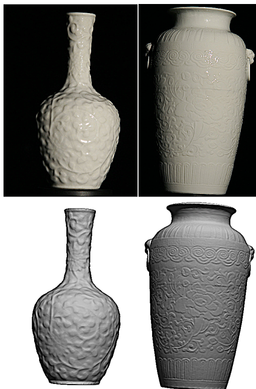
Figure 2: Reconstructing porcelain vases. Top: sample of input images. Bottom: proposed method. The resulting surface captures all the fine details present in the images, even in the presence of strong highlights.

This paper has presented a novel reconstruction technique using silhouettes and the cue of photometric stereo to reconstruct Lambertian objects in the presence of highlights. The main contribution of the paper is a robust, fully self-calibrating, efficient setup for the reconstruction of such objects, which allows the recovery of a detailed 3D model viewable from 360 degrees.