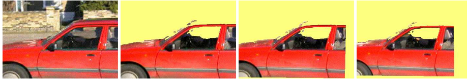
Fig. 6. Multiple-frame segmentation of the ‘car’ sequence. The camera pans to the left to track the car. Shown is the original frame 490 and then the foreground segmentation of part of the sequence, showing every 5th frame. The final region labelling is used to segment all frames in a second pass of the data.