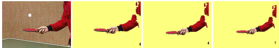
Fig. 5. Multiple-frame segmentation of the ‘tennis’ sequence. The camera zooms out while the arm slowly descends. Shown is the original frame 29 and then the foreground segmentation of part of the sequence, showing every 5th frame. The final region labelling is used to segment all frames in a second pass of the data.

segmentation were continued over a large number of frames then the errors from assuming affine motion would become significant (particularly as the foreman tilts his head back and opens his mouth), and the segmentation would break down. Dealing with non-affine motions is a significant element planned for further work.