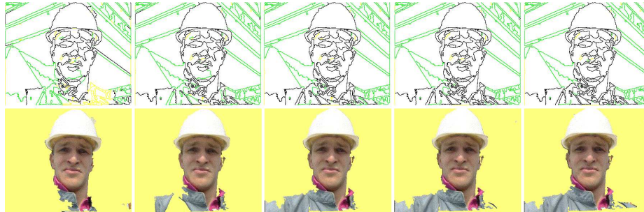
Fig. 4. Evolution of the ‘foreman’ segmentation, showing the edge probabilities and segmentations of frames 47–52 as the evidence is accumulated. The edge probabilities become more certain and small errors are removed, resulting in an improved region segmentation.