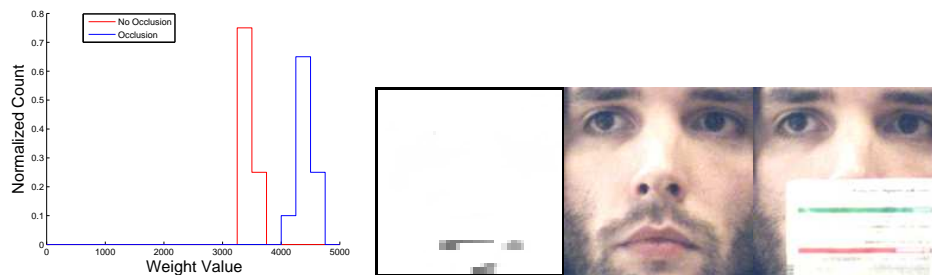
Figure 2: Shift of coefficient distribution under occlusion. The histogram (left) shows the distribution of weights for one of the LNMF basis functions. There is a shift during the occluded case. The images show from left to right: basis image (white=zero, dark=positive), an unoccluded example, an example with occlusion intersecting the positive support region of the basis image.