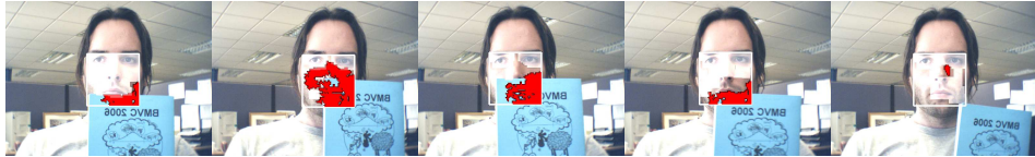
Figure 7: Real-time tracking during occlusion. Tracking continues during partial occlusion. During occlusion new features are allocated in the visible regions allowing tracking to continue. When the occluding object is removed the whole region is again used for feature selection.