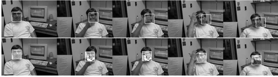
Figure 8: Real-time tracking with occlusion. Tracking results for the public ‘Dudek’ sequence [8]. Row 1 shows sample tracking results without using our adapted online feature selection. Row 2 shows corresponding results with the new algorithm. Regions detected as occluded are coloured white. Note that in contrast to [5] we use rectangle features only.