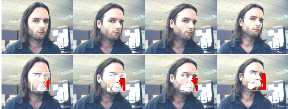
Figure 4: Feature selection under pose change. Large pose changes can lead to large regions of background being inside the target window. By labelling these as outliers, we avoid adaptation to the background. Row 1 shows input frames. Row 2 shows regions detected as occluded (red) and support regions of features (highlighted).

sion detection with varying occlusion size from 5 \times 5 to 155 \times 155 pixels within a window of size 160 \times 160 pixels. We measure the true positive rate and false positive rate in terms of pixel classification rate for each frame in a test sequence of random fixed-size occlusions and take the average to plot a point on the curve. Additional points are generated by running test sequences of differing occlusion size. The detection rate increases with the size of the occluded region. However, larger occlusions lead to an increase in false detections. This is due to the fact that there is no perfect alignment between occluded regions and support regions of basis images.