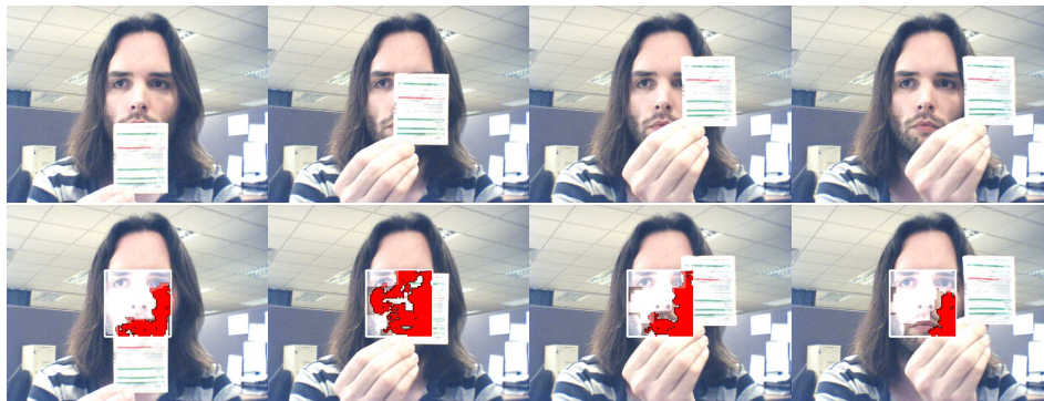
Figure 3: Online feature selection under occlusion. The model helps to avoid erroneous feature selection in the occluded regions. Row 1 shows sample frames. Row 2 shows regions detected as occluded (red) and support regions of features used in the classifier (highlighted).

We run the adapted online feature selection algorithm (see Alg. 1) on a number of test sequences. Figure 3 shows sample frames in the top row and the algorithm output below. The occlusion map is shown in red and the support area of features currently used in the classifier is highlighted in white. We can see there is agreement between the occlusion map and the actual occlusion. Further, the feature selection is restricted to those areas labelled as not occluded. Figure 4 shows an example sequence with a large pose change. In such cases the target image can contain background regions. The outlier detection prevents feature selection in these regions.