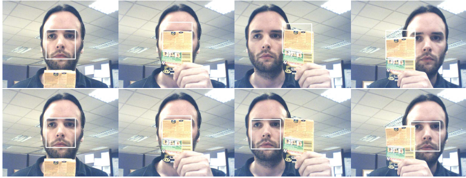
Figure 6: Real-time tracking with occlusion. Row 1 shows tracking results with feature selection using online boosting. The flexibility of the classifier leads to adaptation to the occluding object. Row 2 shows corresponding results with the new algorithm.