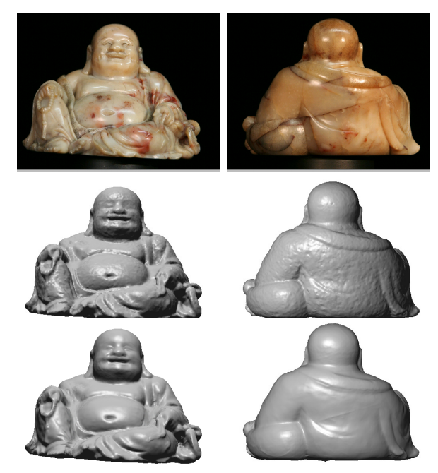
Figure 3: Reconstructing coloured marble. Top: Two input images. Middle: model obtained by multi-view stereo method from [HS04]. Bottom: proposed method. The resulting surface is filtered from noise while new high frequency geometry is revealed (note the reconstructed surface cracks).

[KZ02] KOLMOGOROV V., ZABIH R.: Multi-camera scene re-